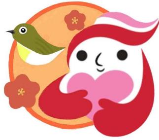
Symbol mark of victim support, Wakayama version "Kisyu no Gyutto-chan"

This leaflet provides the following information to victims.